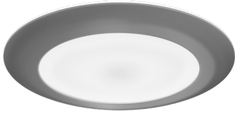
Gardco SoftView parking garage