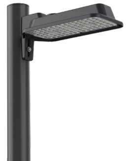
Stonco LytePro Area