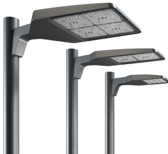
Gardco OptiForm site and area