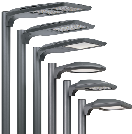
Gardco PureForm site and area