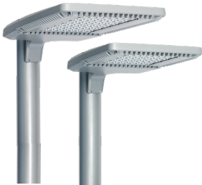
Gardco EcoForm site and area