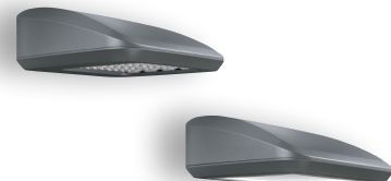
Gardco PureForm wall mount

➤ Questions about Interact? Contact us directly.