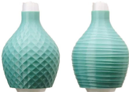
FC Fishnet Coarse